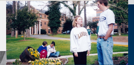
Outside Chipley Hall, 1990s