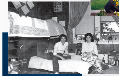
Residential Room, 1982