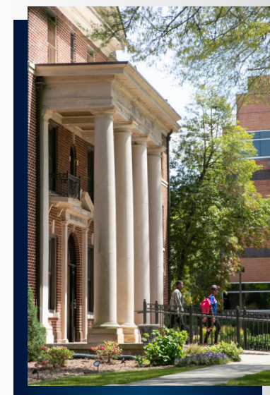
Then (top) and Now (bottom)