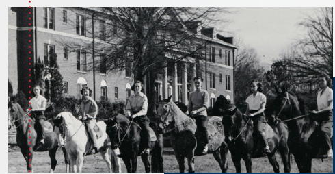
Horseback Riding, 1934