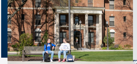
Outside Chipley Hall, 2024

- Miriam Stevenson, '55, Miss Universe '54